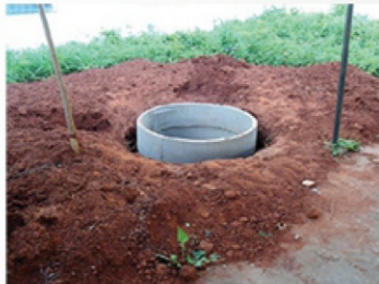
Rainwater Harvesting Pits