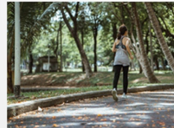
Jogging & Walking Track