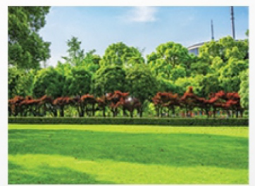
Open Lawns & Landscaped Gardens