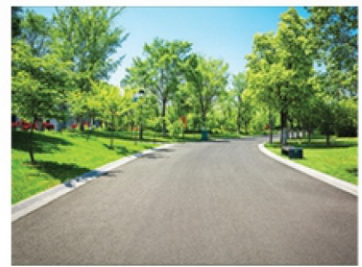
Black Top (BT) Roads