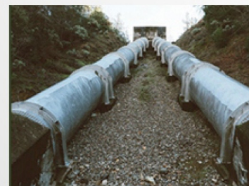
Underground Drainage System