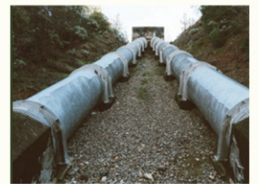
Underground Drainage System