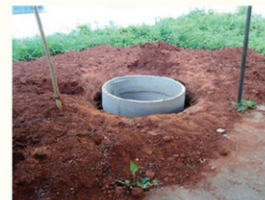
Rainwater Harvesting Pits