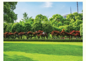
Open Lawns & Landscaped Gardens