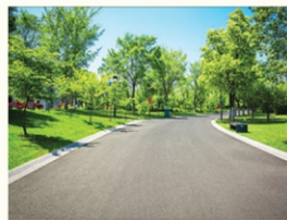
Black Top (BT) Roads