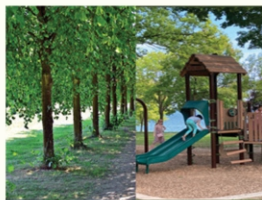
Avenue Plantation & Children's Play Area