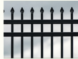
Fencing All Around the Community