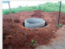
Rainwater Harvesting Pits