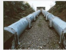
Underground Drainage System