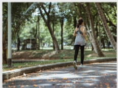
Jogging & Walking Track