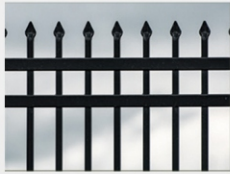
Fencing All Around the Community