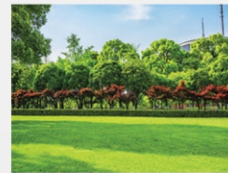
Open Lawns & Landscaped Gardens